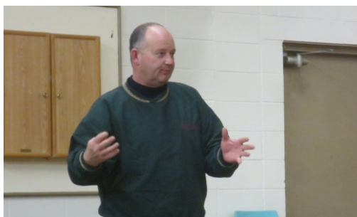
Guest Realtor Making a New Property Presentation