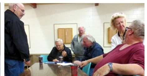
A few established members mingling, looking at and discussing printed materials from the S L A Chicago Chapter